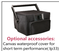
Optional accessories: Canvas waterproof cover for short term performance(Ip33)