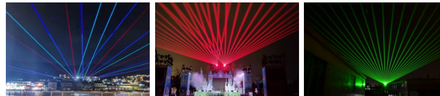
The Head Can Rotating 360°